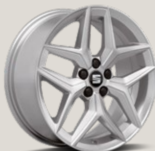
DYNAMIC 17" ALLOY WHEELS FR