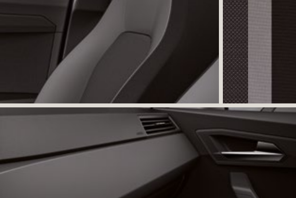
CLOTH BLACK & GREY COMFORT SEATS CB