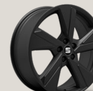
SPORT 18" BLACK ALLOY WHEELS St XC FR

Reference R Style St Xcellence XC FR FR Serial Optional