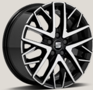
URBAN 16" BLACK R MACHINED ALLOY WHEELS St XC