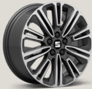
DESIGN 16" ATOM GREY MACHINED ALLOY WHEELS XC