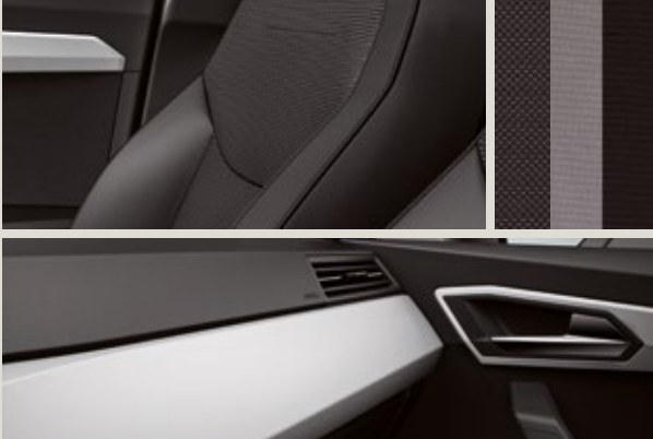
CLOTH EDGE COMFORT SEATS CD