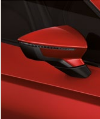
DESIRE RED 2,3 St XC FR