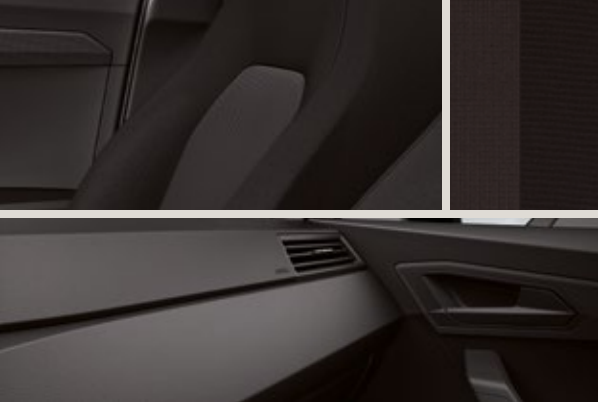
CLOTH BLACK COMFORT SEATS AF