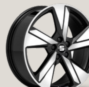
PERFORMANCE 18" BLACK MACHINED ALLOY WHEELS St XC FR