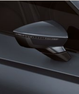
MAGNETIC TECH 2,3 R St XC FR