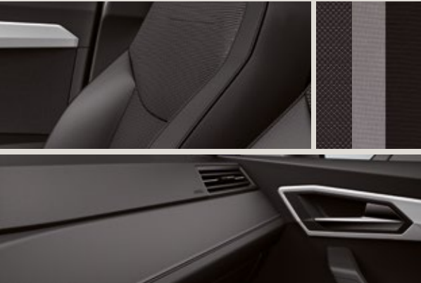
CLOTH EDGE COMFORT SEATS WITH LEATHER PAD CD + PIF