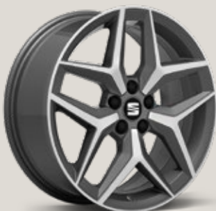
DYNAMIC 17" ATOM GREY MACHINED ALLOY WHEELS XC