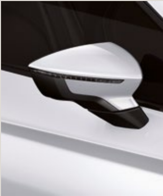
NEVADA WHITE 2,3 R St XC FR