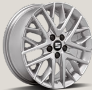
DESIGN 16" ALLOY WHEELS St