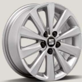
ENJOY 15" ALLOY WHEELS R St XC