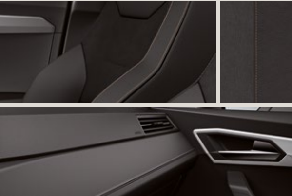
DINAMICA® BLACK SPORT SEATS CD + PIF + PL7