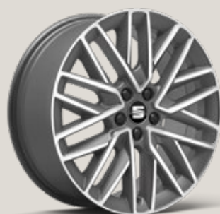
DYNAMIC 17" COSMO GREY MACHINED ALLOY WHEELS St XC