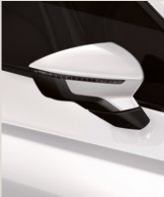
CANDY WHITE 1,3 R St XC FR