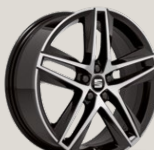
PERFORMANCE 18" GLOSSY BLACK MACHINED ALLOY WHEELS FR