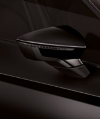
MIDNIGHT BLACK 2,3 R St XC FR

1 Soft colour. 2 Metallic colour. 3 Exterior mirrors in Black for Reference, in Atom Grey for Xcellence and in Brilliant Black for FR trim.