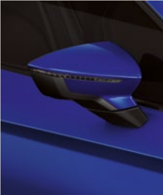
MYSTERY BLUE 2,3 R St XC FR