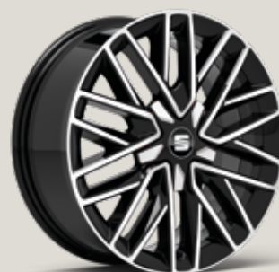
DYNAMIC 17" BLACK MACHINED ALLOY WHEELS St XC