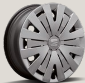
URBAN 15" STEEL WHEELS R St