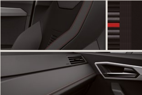
CLOTH BLACK SPORT SEATS FL