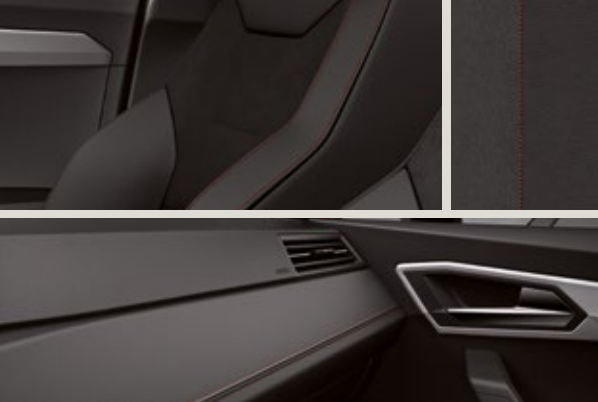
DINAMICA® BLACK SPORT SEATS FL + PL7