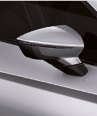
URBAN SILVER 2,3 R St XC FR